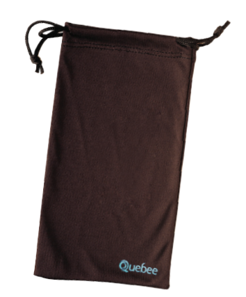
Spectacles Bag QB-D401-BLK

3M<sup>™</sup> Super-clear<sup>™</sup> Disposable Protective Eyewear Lens Cleaning Station (1520DM)