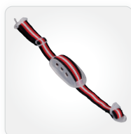
P5 QB-AS-P5 Elastic chin strap with chin cup