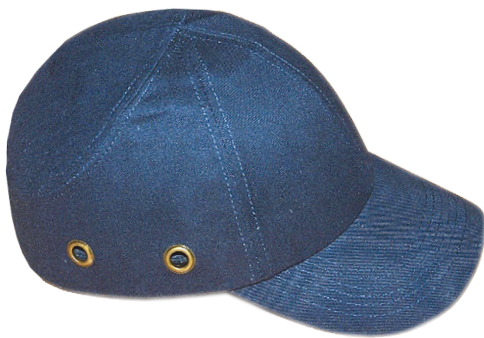
Safeware Baseball Cap SW-SM-913-56-BU

* Logo embroidery available as requested