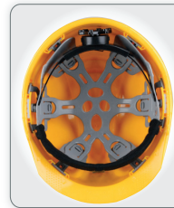
P3 QB-LR-P3- AQM2-RAT

Plastic suspension with wheel ratchet headband adjustment for AQM2