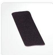
P4 QB-AS-P4 Sweatband