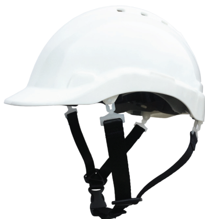
QB Safety Helmet QB-AQM8