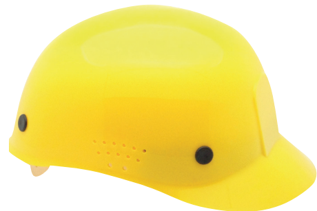
Safeware HDPE Bump Cap SW-SM-903-56