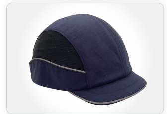
QB-BC-SC02SV-NB Navy Blue- short peak