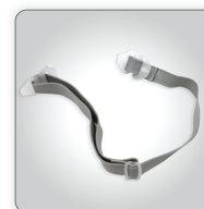
Safeware SW-PVCCS PVC chin strap