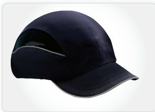
QB-BC-SC02SS-NB Navy Blue